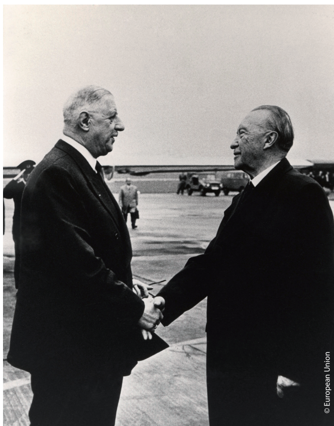
Adenauer shaking hands with French President Charles de Gaulle in 1961.

After the war, Adenauer was reinstated as Mayor of Cologne by the Americans but removed shortly afterwards by the British, when Cologne was transferred into the British zone of occupation. This gave Adenauer the time to devote himself to the setting up of the Christian Democratic Union (CDU) which he hoped would unify Protestant and Catholic Germans in one party. In 1949, he became the first Chancellor of the Federal Republic of Germany (West Germany). Initially, it was thought that Adenauer would be Chancellor for only a short time, as he was already 73 years old by this time. However, despite this belief, Adenauer (nicknamed 'Der Alte', or 'The Elder') went on to hold this position for the next 14 years, making him not only the youngest ever mayor of Cologne, but also the oldest chancellor Germany has ever seen. Under his leadership, West Germany became a stable democracy and achieved a lasting reconciliation with its neighbouring countries. He managed to regain some sovereignty for West Germany, by integrating the country with the emerging Euro-Atlantic community (NATO and the Organisation for European Economic Cooperation).